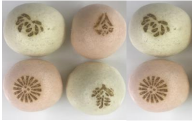
Steamed "Fukashi" Manju