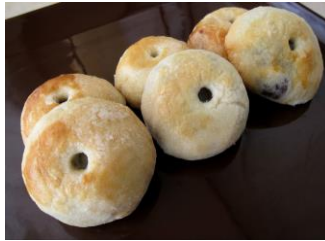
Baked "Yaki" Manju