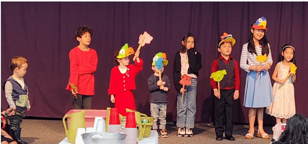
Dharma School Class performing Buddha Loves You