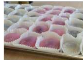
Mochi Manju cooling

Our own Dharma School students will be making Manju to sell at the Holiday Boutique. Please come out and support them!