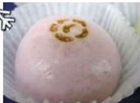
Fukashi "Steamed" Manju