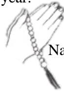
Namu Amida Butsu

Within Jodo Shinshu, we say “Namo Amida Butsu”. Namo Amida Butsu is Amida Buddha, transcending time and space, past, present and future, coming into the now. Namo Amida Butsu is both Amida Buddha calling to me to come as I am and my response of gratitude to Amida. When I try to catch the present and it slips from my grasp into the past and future, when my life moves from anticipation to reflection, when I realize there are more yesterdays than tomorrows, Namo Amida Butsu is all that is true and real. Namo Amida Butsu is saying it is and was a very good year.